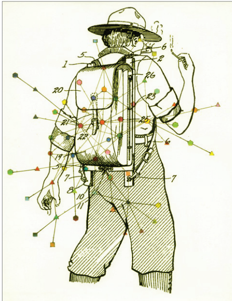
Digital working proof for "Prospects", 2011

Shira Farber HEMPHILL Fine Arts 1515 14th Street NW Washington, DC 20005 202.234.5601 shira@hemphillfinearts.com www.hemphillfinearts.com