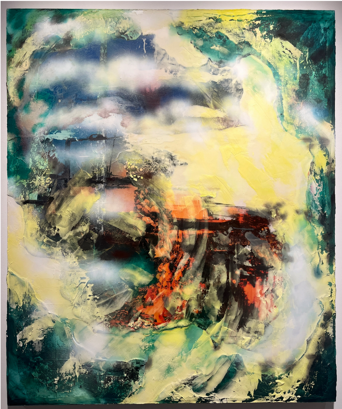
Hushed Blaze 2024 Acrylic, resin, paper, & plaster on canvas 60 x 48 inches