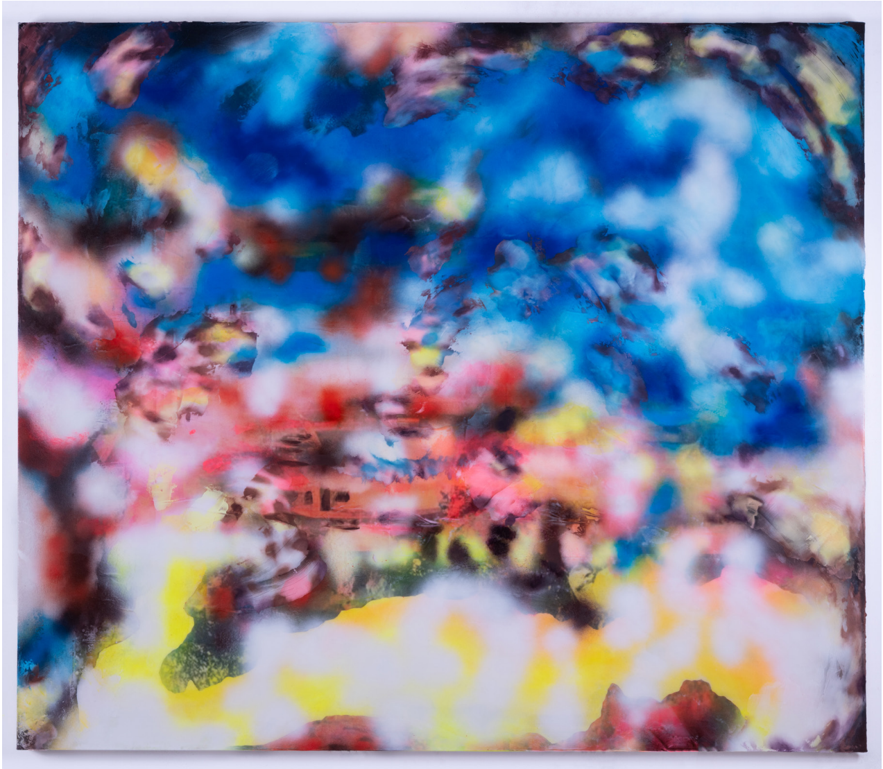
Clash I 2024 Acrylic, spray-paint, resin, paper, & plaster on canvas 62 x 72 inches