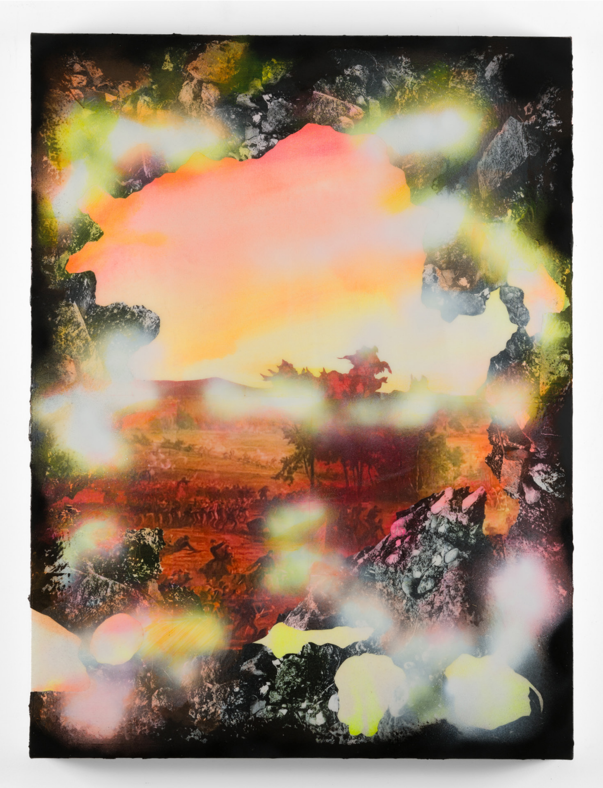
Untitled (Gettysburg Landscape) 2024 Acrylic, resin, paper, & plaster on canvas 40 x 30 inches