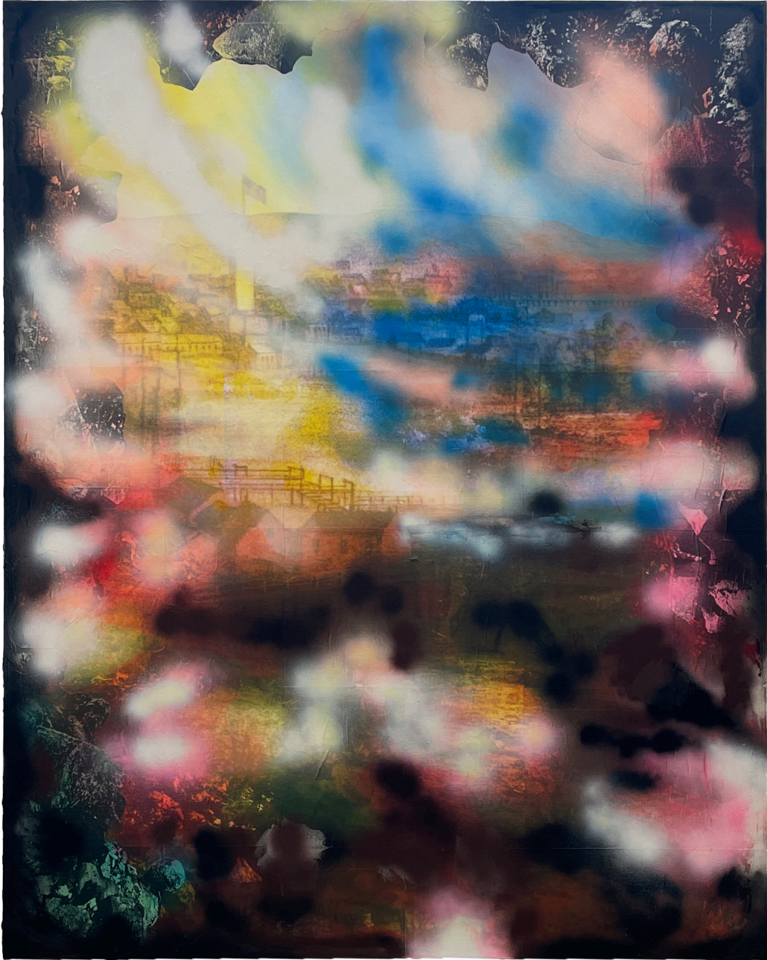
Whispers Along the Alexandria Canal II 2024 Acrylic, spray-paint, resin, paper, & plaster on canvas 60 x 48 inches