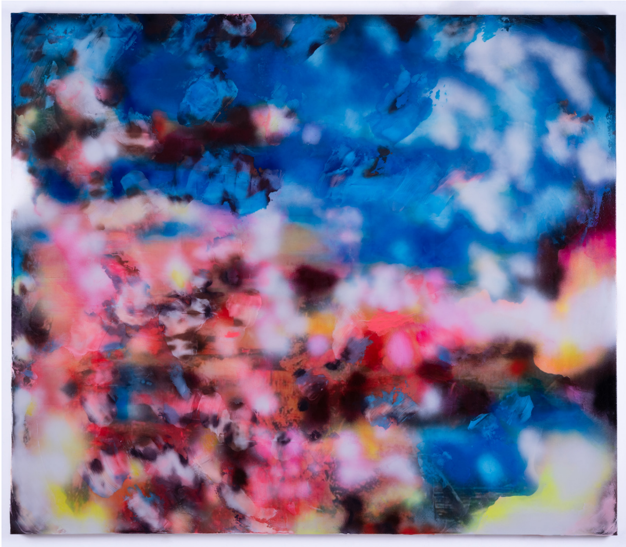
Clash II 2024 Acrylic, spray-paint, resin, paper, & plaster on canvas 62 x 72 inches