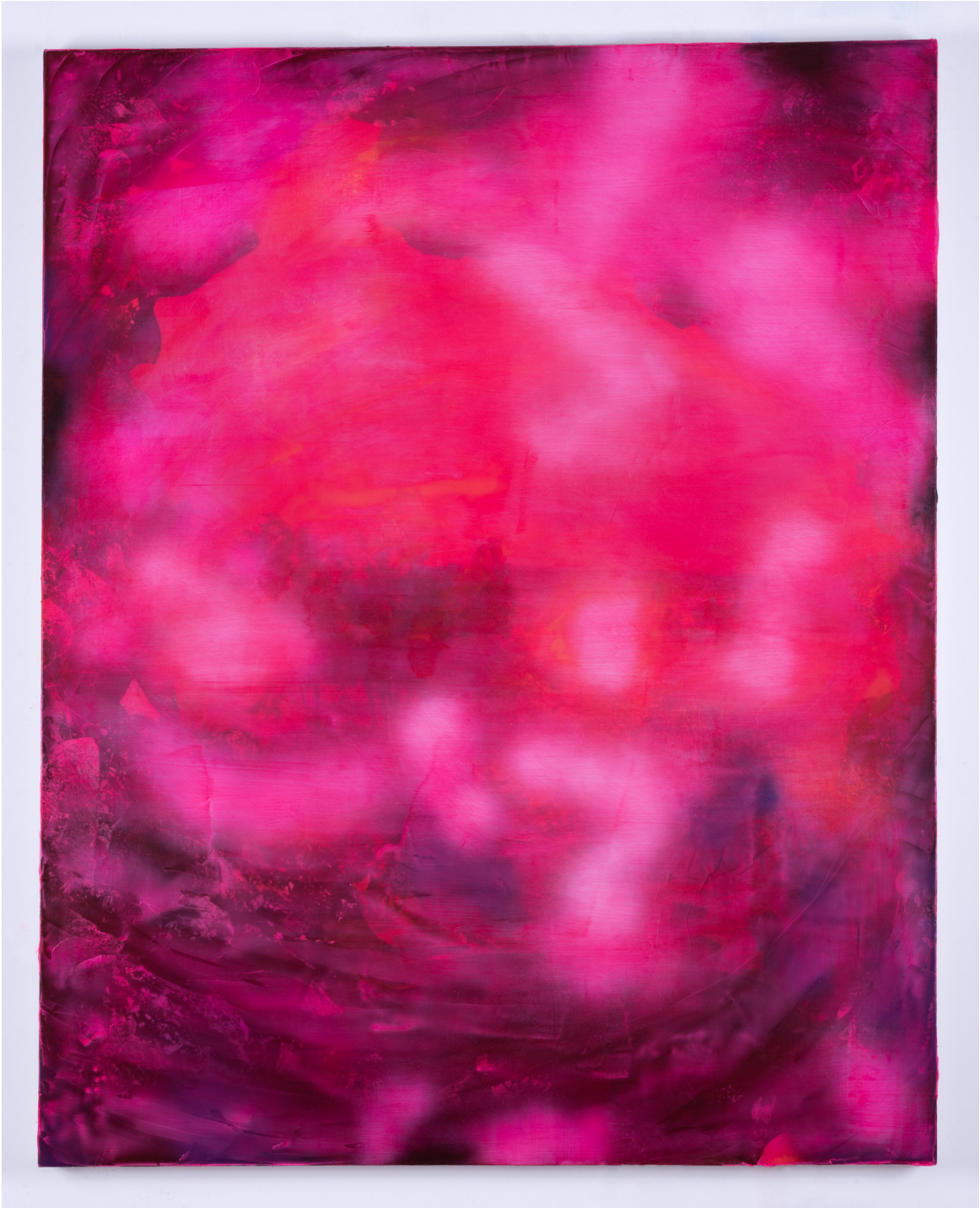
Ascension II 2024 Acrylic, spray-paint, resin, paper, & plaster on canvas 50 x 40 inches