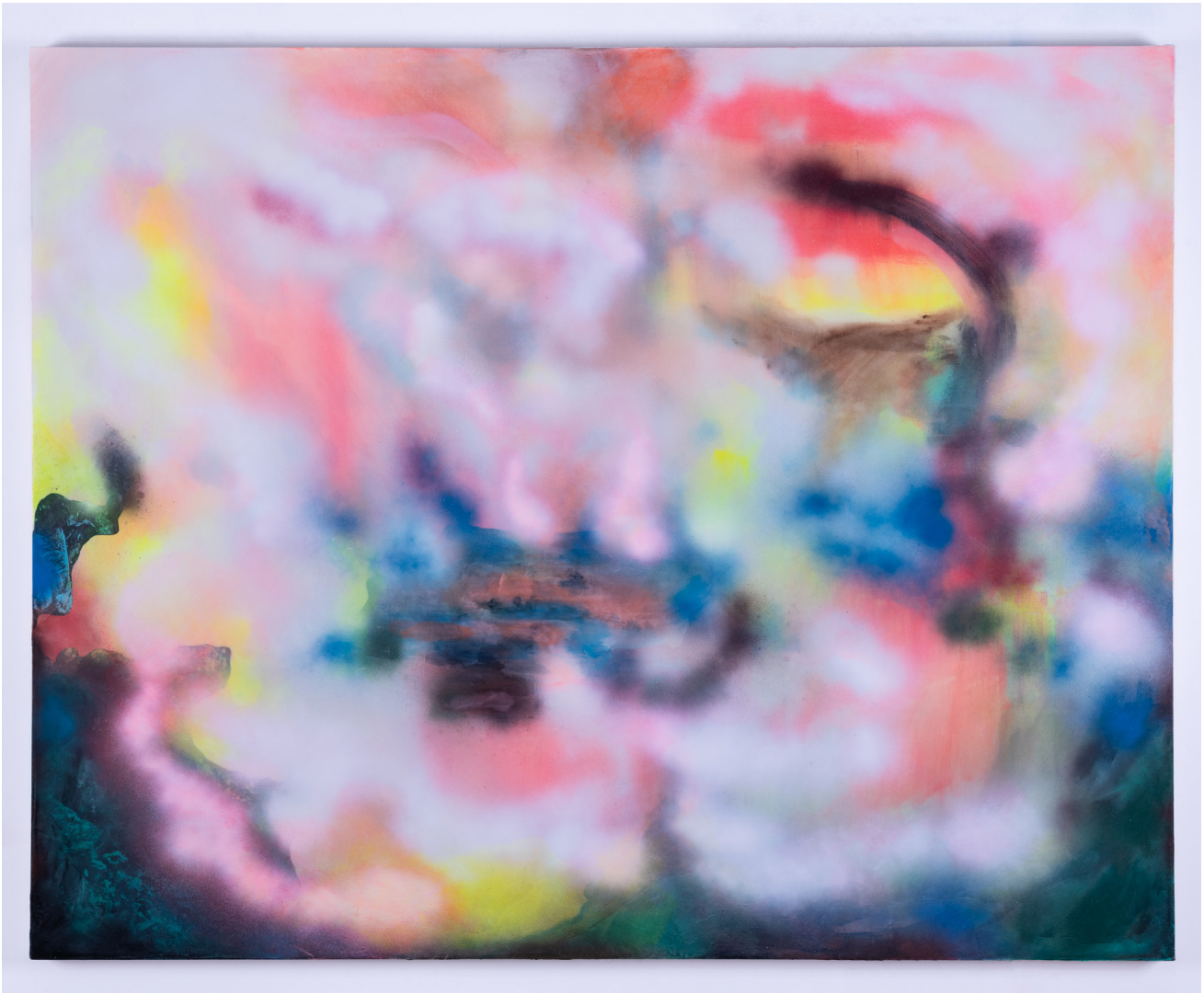
Ghost Forest 2024 Acrylic, spray-paint, resin, paper, & plaster on canvas 48 x 60 inches