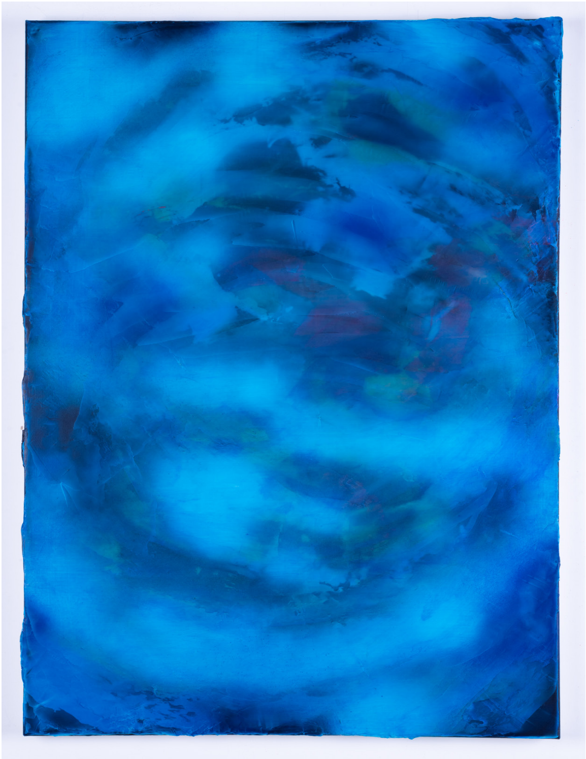
Muted Ember 2024 Acrylic, resin, paper, & plaster on canvas 36 x 24 inches