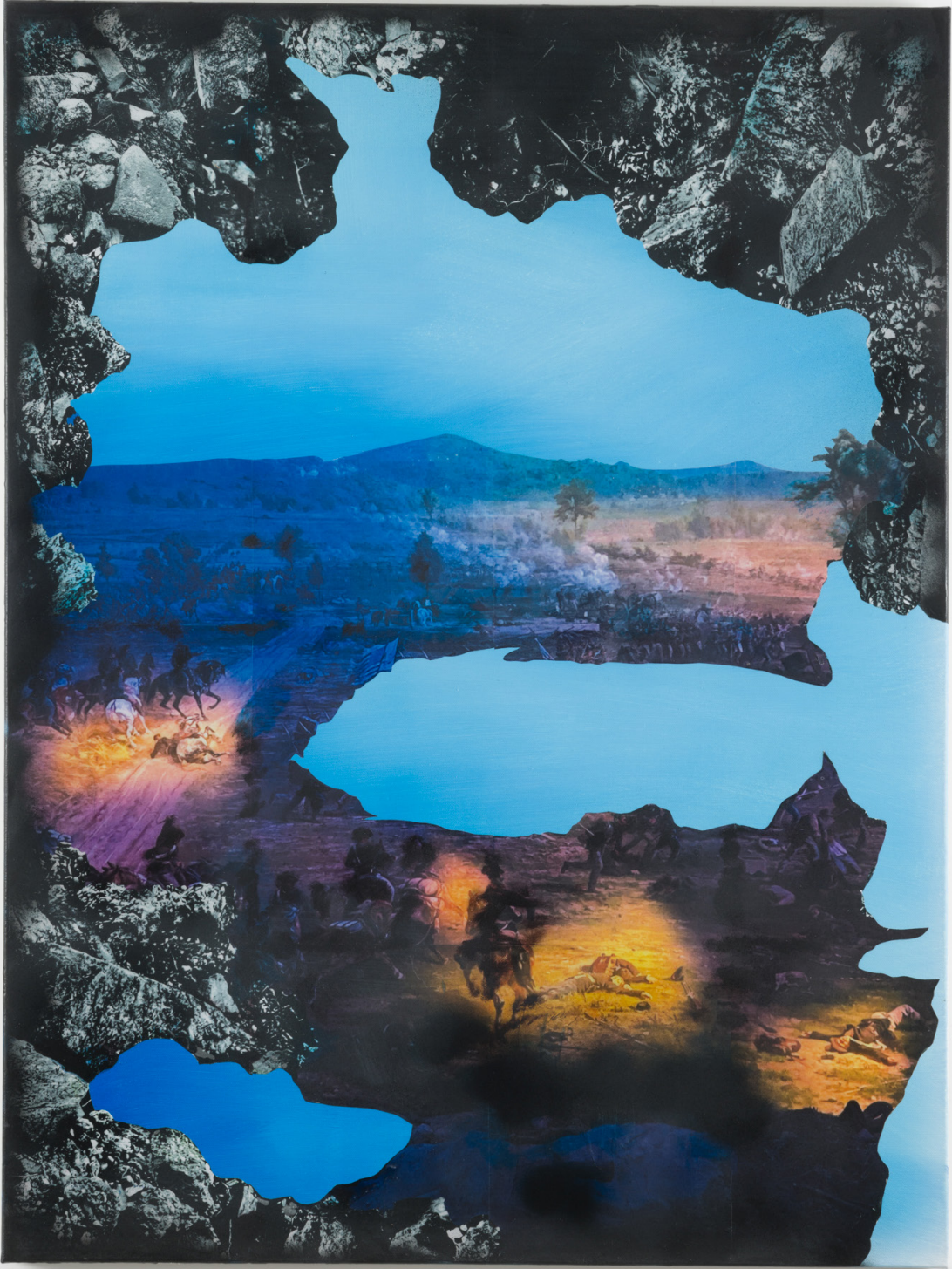
What Remains 2024 Acrylic, resin, paper, & plaster on canvas 40 x 30 inches