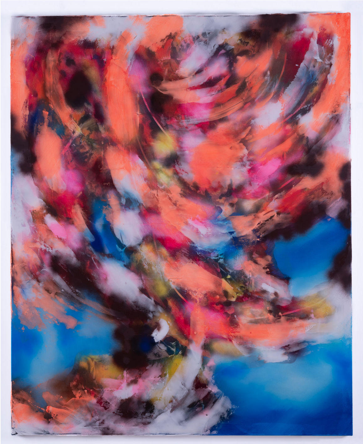
Bombardment 2024 Acrylic, spray-paint, resin, paper, & plaster on canvas 60 x 48 inches