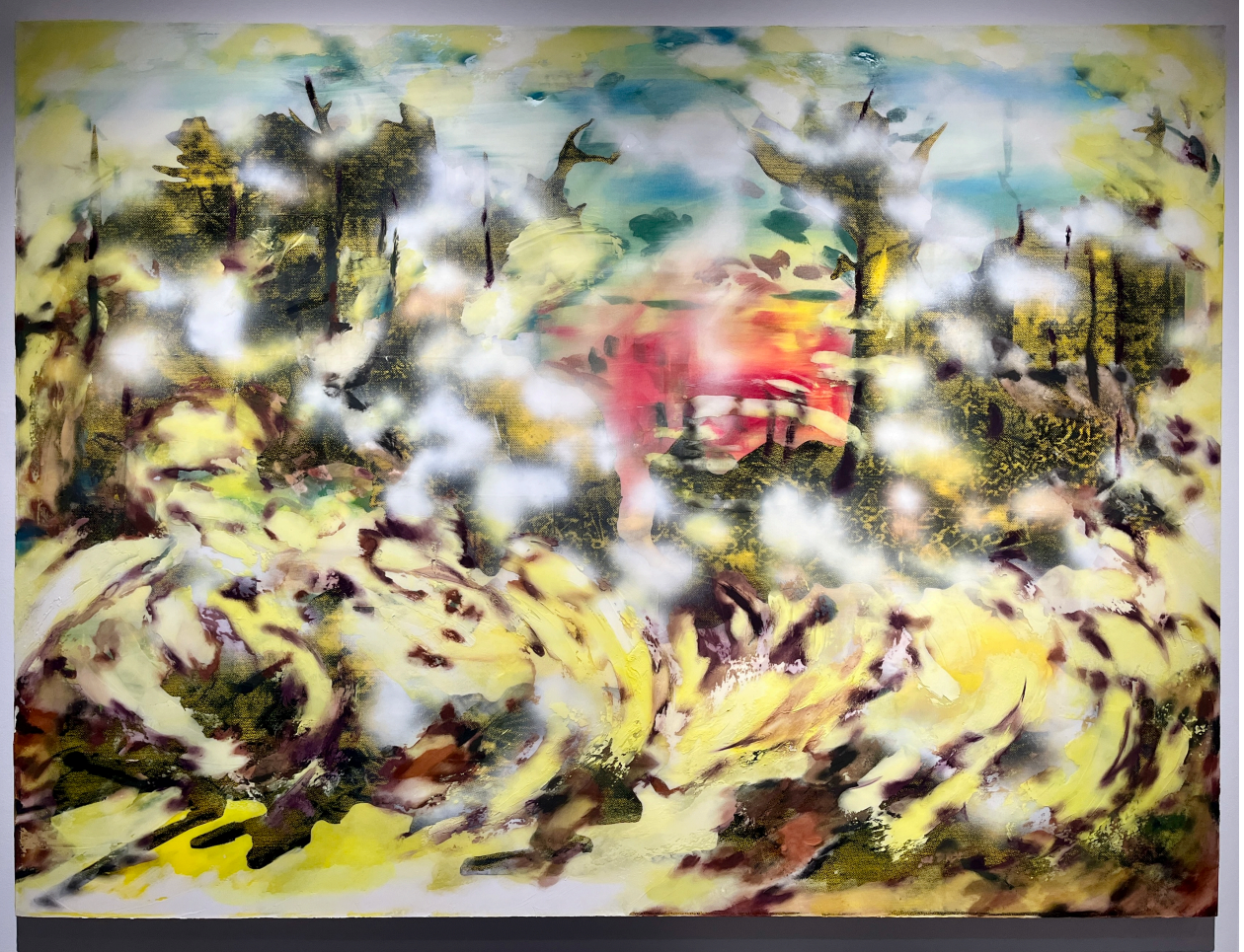
The Fall of Atlanta 2024 Acrylic, spray-paint, resin, paper, & plaster on canvas 62 x 84 inches