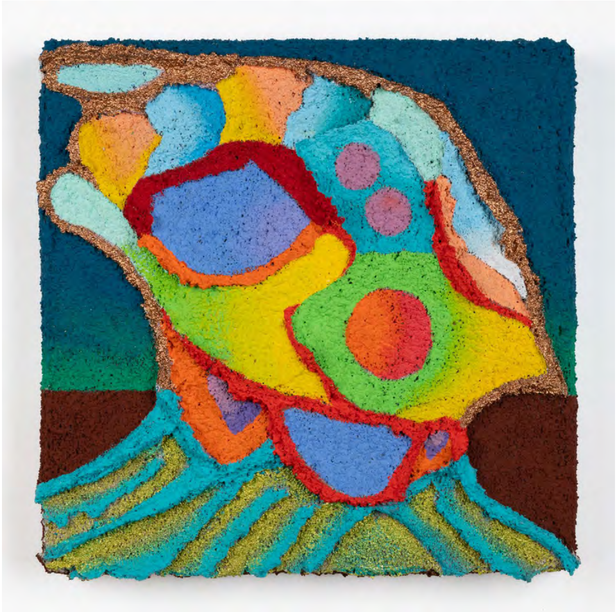
Yellow Bird of Existential Grief, 2026 pumice gel, acrylic and Flashe on wood panel 12 x 12 x 2 inches