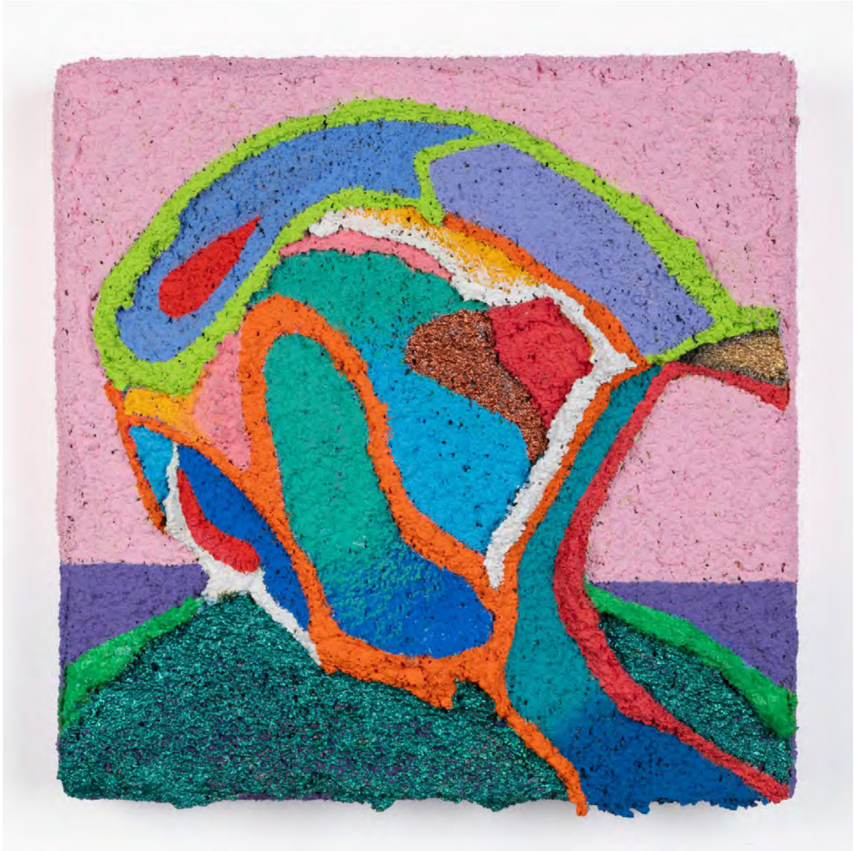
Cleft Palate God, 2026 pumice gel, acrylic and Flashe on wood panel 12 x 12 x 2 inches