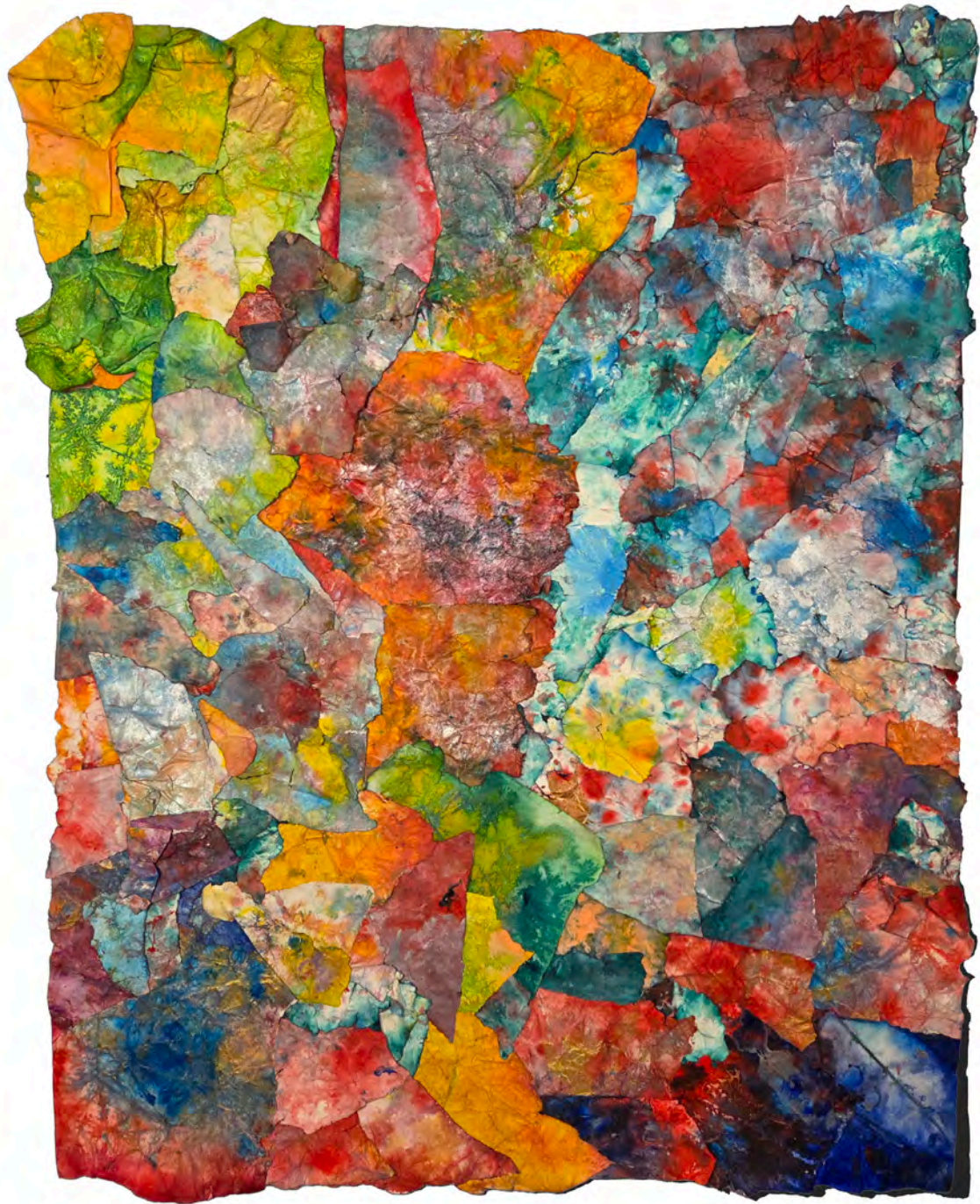
A Mountain by Myself (after Gilliam), 2026 mixed media on paper 40 x 32 inches