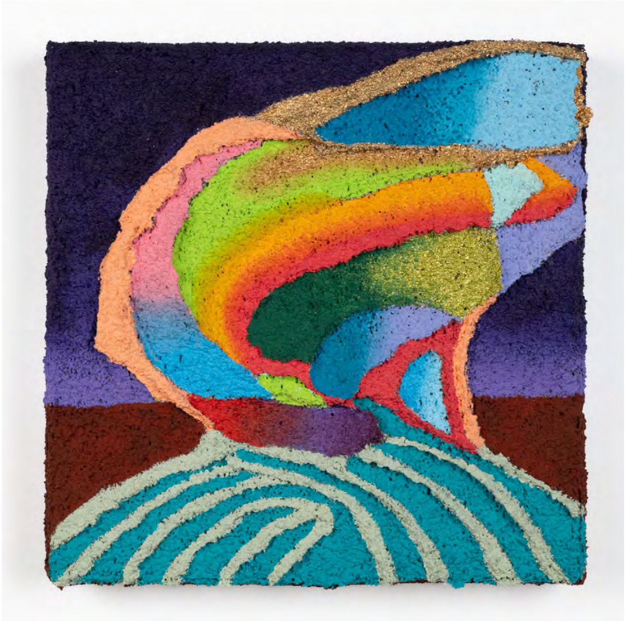
Birdhead God (citing rumors of war), 2026 pumice gel, acrylic and Flashe on wood panel 12 x 12 x 2 inches