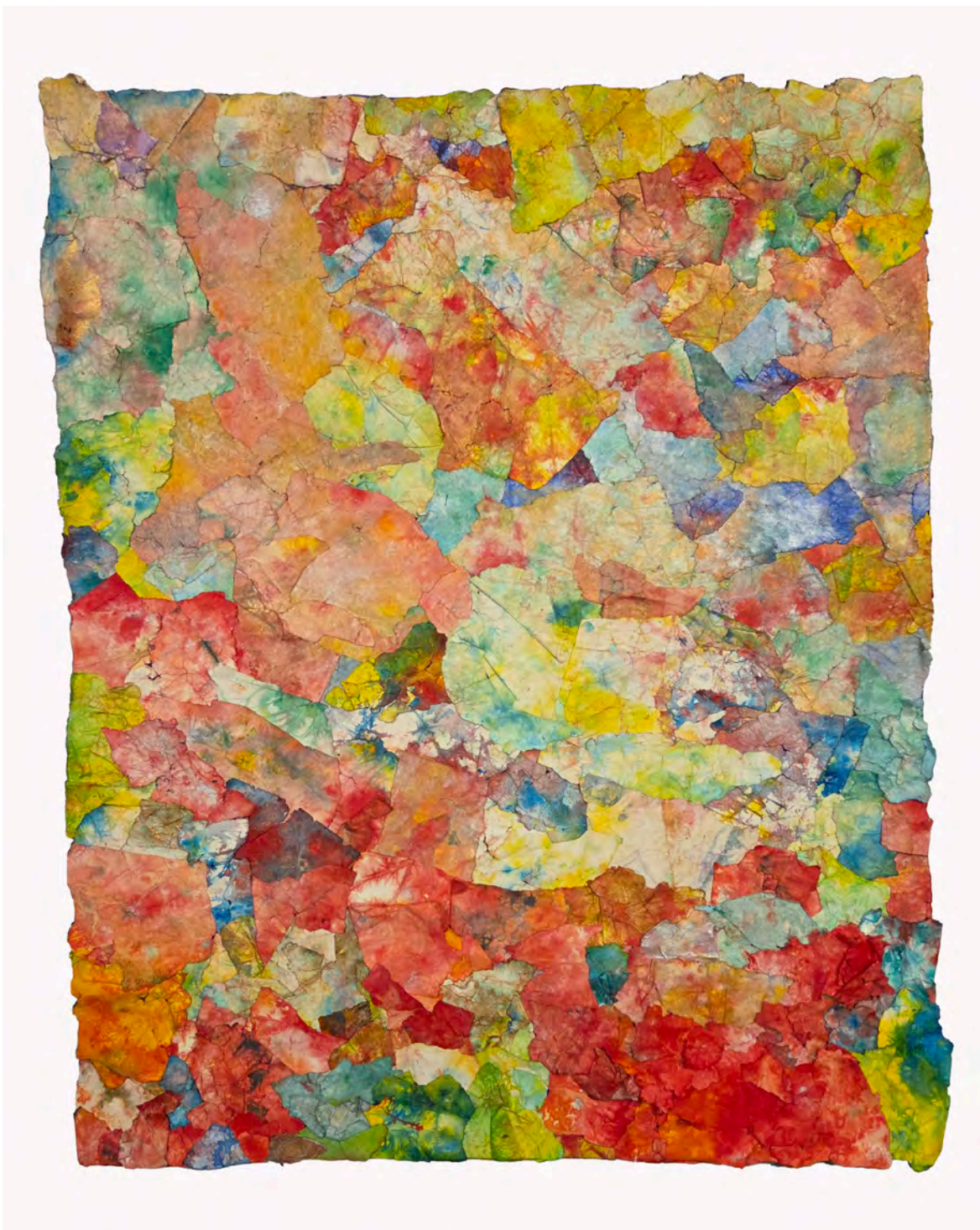
Other Countries, 2026 mixed media on paper 40 x 32 inches