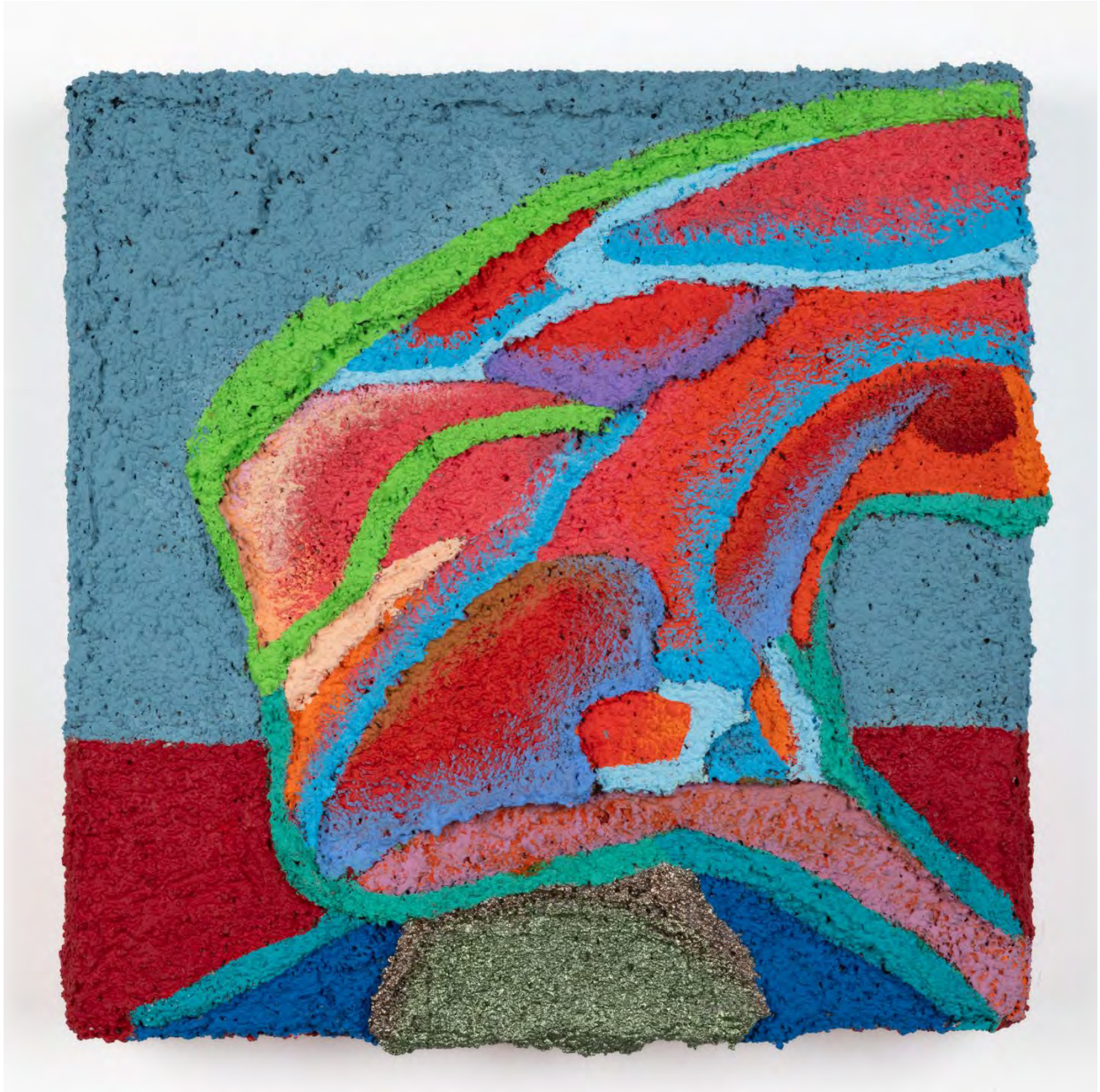
Figura Penitente (con nopal) , 2026 pumice gel, acrylic and Flashe on wood panel 12 x 12 x 2 inches