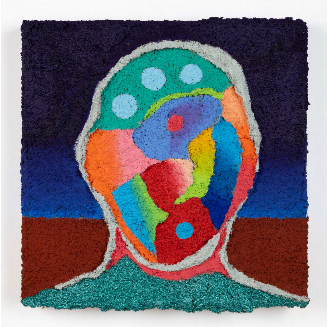
Self-Portrait Comme des Fauves, 2026 pumice gel, acrylic and Flashe on wood panel 12 x 12 x 2 inches