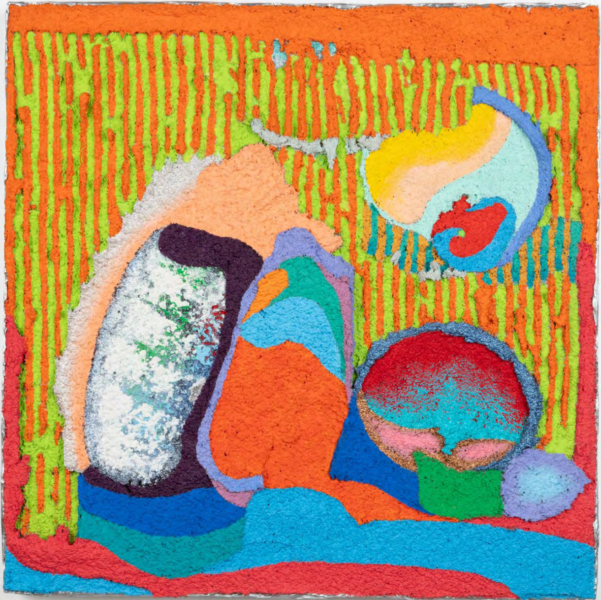
Light Candles, 2025 pumice gel, acrylic and Flashe on wood panel 24 x 24 x 2 inches