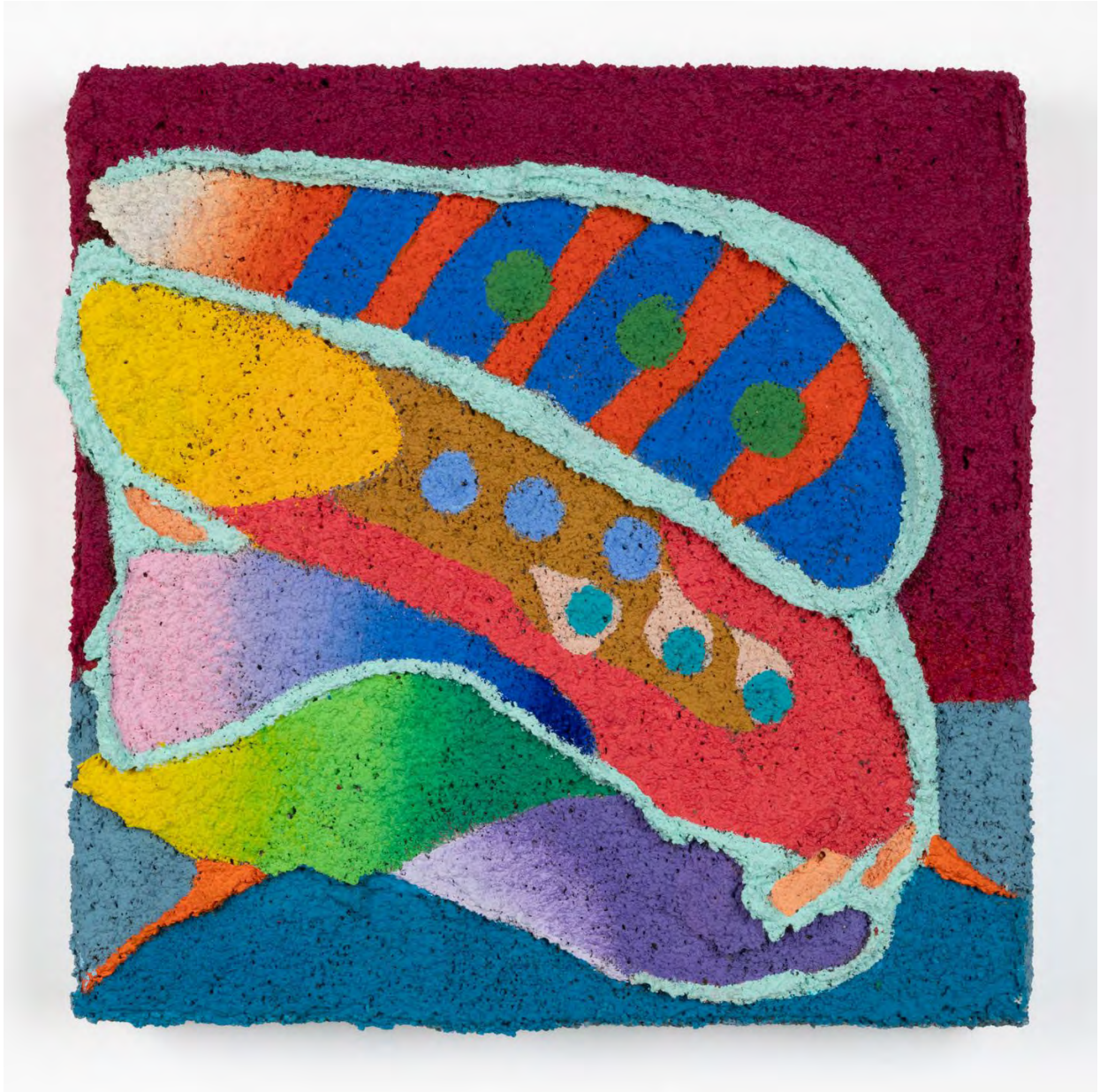
The Full Moon Is My Girlfriend, 2026 pumice gel, acrylic and Flashe on wood panel 12 x 12 x 2 inches