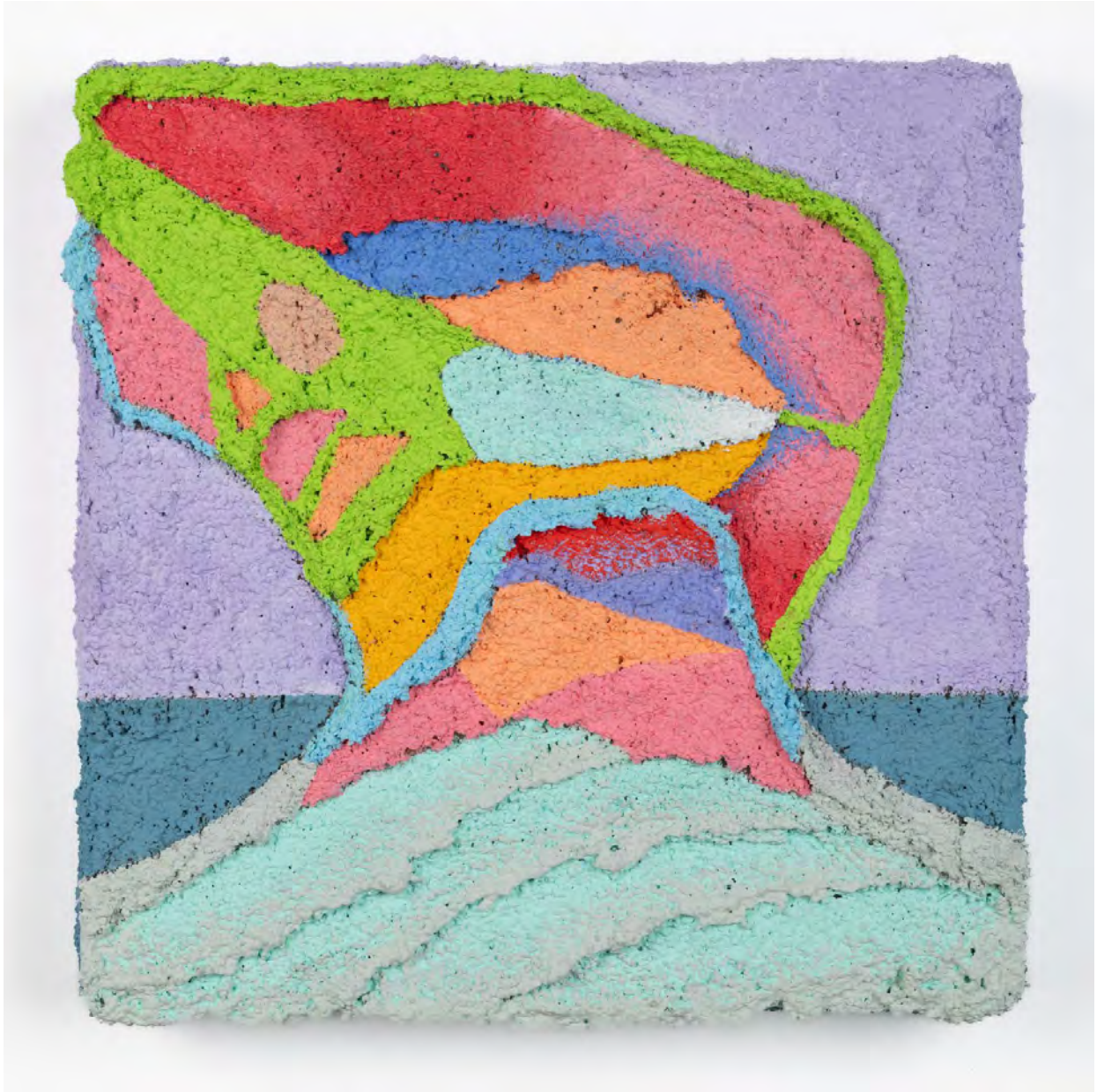
Pink-Hooded Figure, Facing Away, 2025 pumice gel, acrylic and Flashe on wood panel 12 x 12 x 2 inches