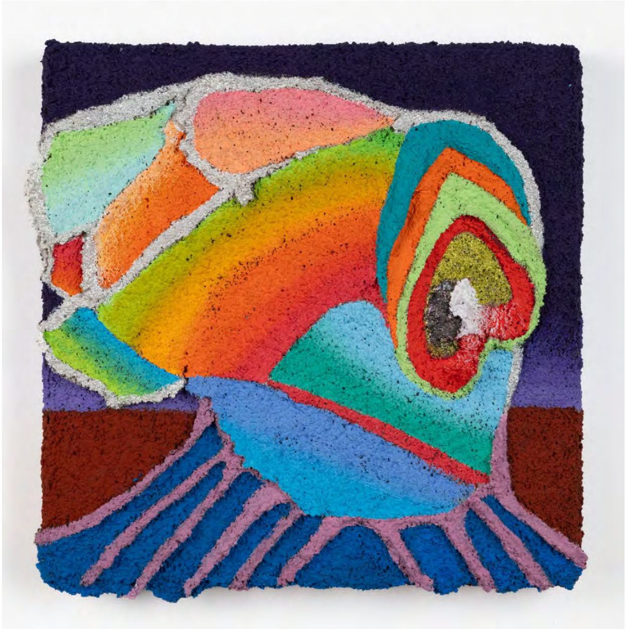
God Lamprey, 2026 pumice gel, acrylic and Flashe on wood panel 12 x 12 x 2 inches