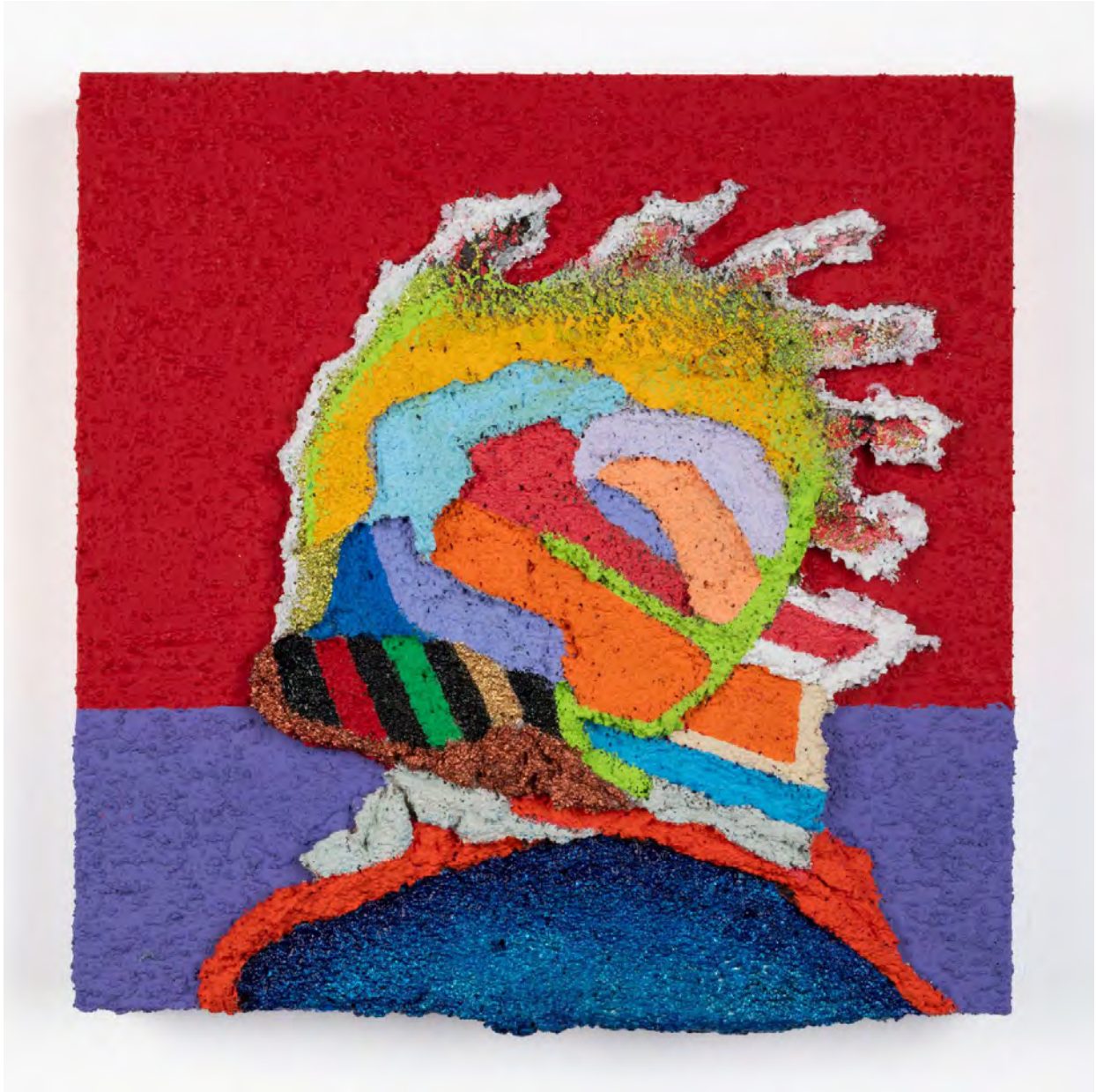
Toussaint-Like, 2025 pumice gel, acrylic and Flashe on wood panel 12 x 12 x 1 3/4 inches