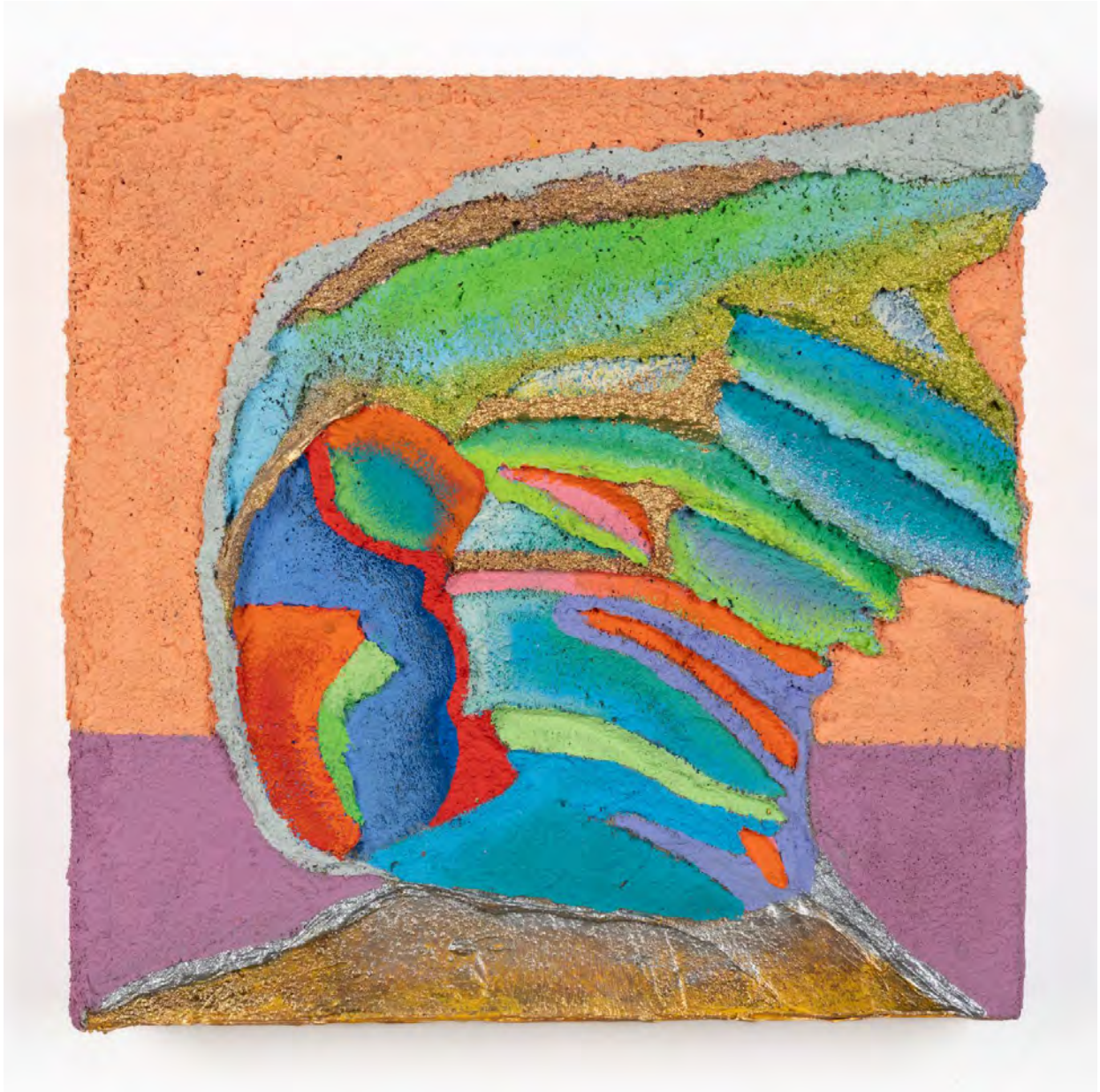
Green Wing, 2025 pumice gel, acrylic and Flashe on wood panel 12 x 12 x 2 inches