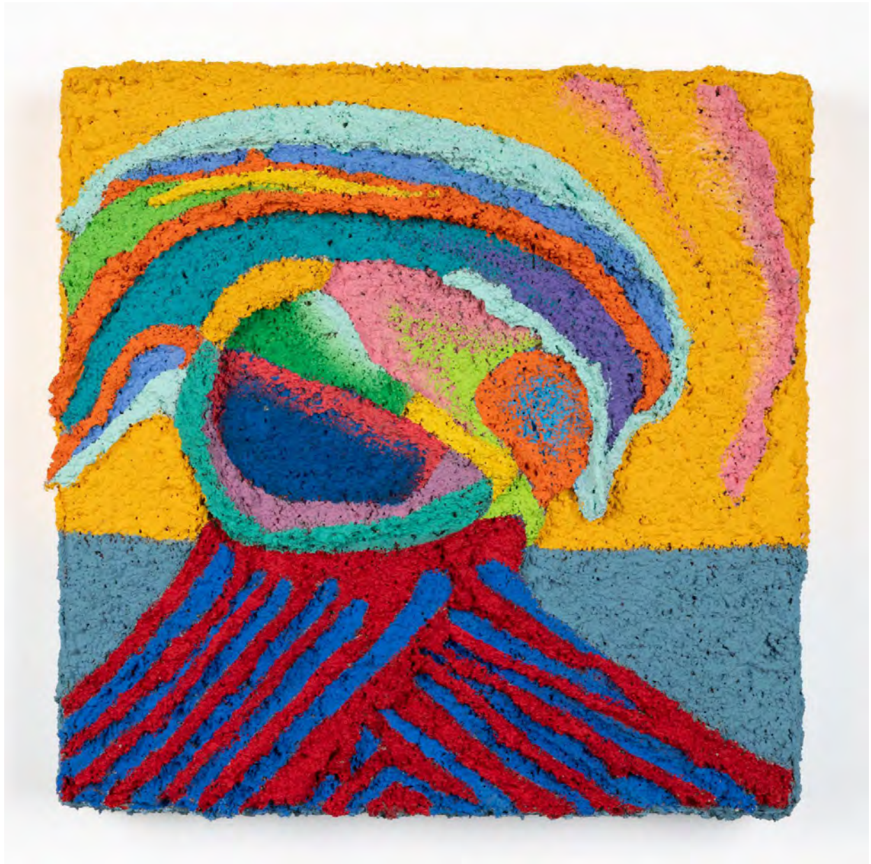
Of the Seven, 2025 pumice gel, acrylic and Flashe on wood panel 12 x 12 x 2 inches